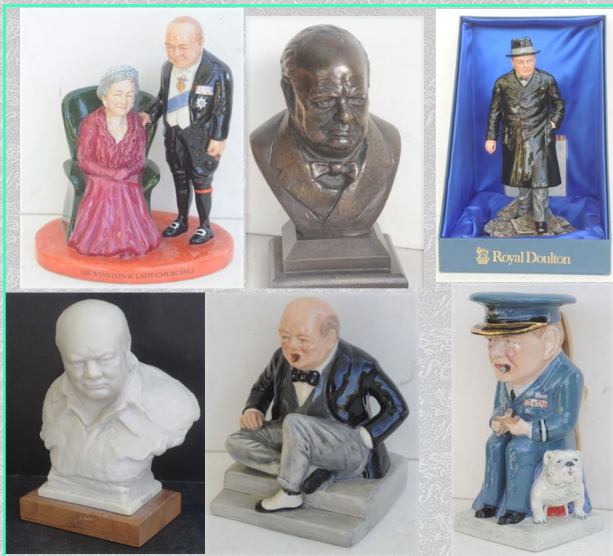
From top left, catalogue nos: 109, 11, 3, 49, 139, 37

An extensive collection of bronze busts, ceramic figures and jugs, silver, glass, and plates